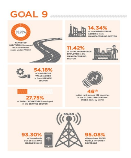
Figure 3. Interconnected Pillars of SDG 9 and its Achievement.

Sustainable Development Goal 9 (SDG 9) is founded on three interconnected pillars: infrastructure, industry, and innovation. The objective of attaining socially inclusive and environmentally sustainable economic development is shared by all of these pillars. SDG 9 is closely associated with other SDGs that address job creation, sustainable livelihoods, enhanced health, technology and skills development, gender equality, food security, green technologies, and climate change. It has approximately 20 targets and indicators that are directly related to its three pillars.