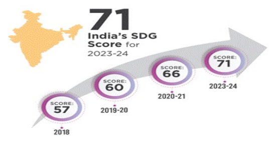
Figure 1: Progression of SDG Score.

India's dedication to the Sustainable Development Goals (SDGs) since embracing the 2030 Agenda for Sustainable Development is seen in the coordinated initiatives on SDG localisation led by NITI Aayog, which collaborates closely with States and Union Territories (UTs). NITI Aayog has collaborated with States and Union Territories (UTs) to institutionalize the Sustainable Development Goals (SDGs). This involves not only conceptualising sustainable development as a separate or parallel framework, but also integrating them into national and subnational development thinking through institutional ownership, collaborative competition, capacity building, and adopting a whole-of-society approach.